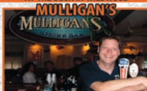
MULLIGAN'S SHORE BAR IS NOW OPEN IN WILDWOOD