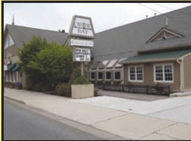
STEAKS, SEAFOOD & COCKTAILS AT OYSTER BAY IN CAPE MAY • SEE PAGE 3