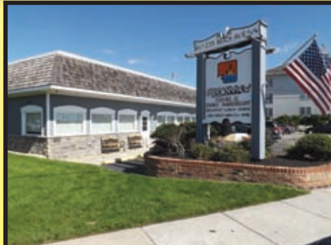
ENJOY BREAKFAST, LUNCH & DINNER AT THE OCEANVIEW • SEE PAGE 12