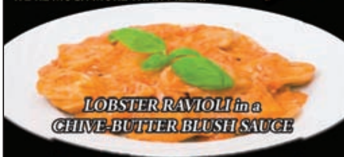
LOBSTER RAVIOLI in a CHIVE-BUTTER BLUSH SAUCE

$5 LUNCH SPECIALS MONDAY-FRIDAY 11AM-4PM FULL 12" SUBS (VARY DAILY)