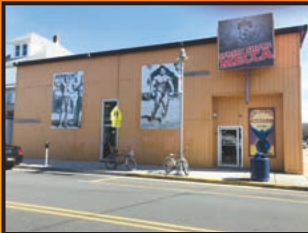
OVER 17,000 SQ. FT. OF WORKOUT SPACE AT ATILIS GYM • SEE PAGE 22