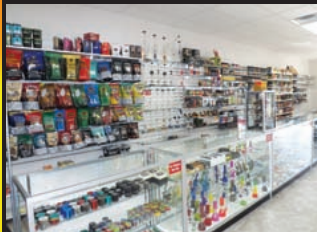
TOBACCO & VAPOR MART NOW OPEN IN CAPE MAY COURT HOUSE • SEE PAGE 2