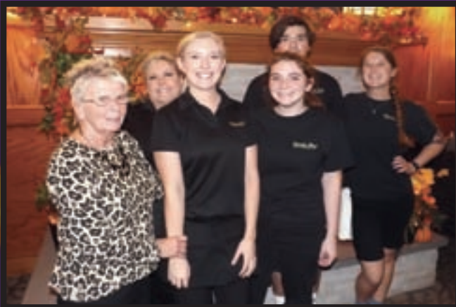
FOOD, DRINKS & FUN AT OWEN'S PUB • SEE PAGE 8