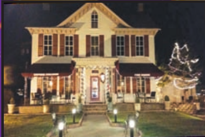
FINE ITALIAN CUISINE AT SAPORE ITALIANO • SEE PAGE 8