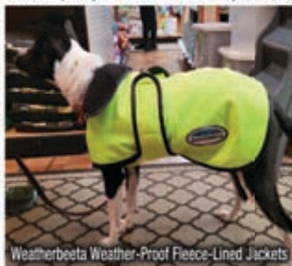
Weatherbeeta Weather-Proof Fleece-Lined Jackets

one of our shelter cats, Ziggy, to the vet at the beginning of last week. The hematoma was drained but filled up again overnight. He was operated on Tuesday this week. I sent him with one of our soft cones that also has clear areas for him to see through and is attached to his collar. I will let you know how he manages with it.