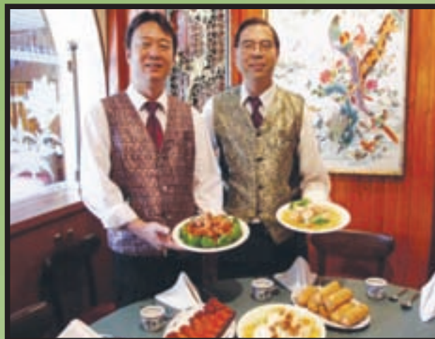
FANTASTIC CHINESE CUISINE FOR LUNCH OR DINNER DAILY AT THE DRAGON HOUSE • SEE PAGE 24