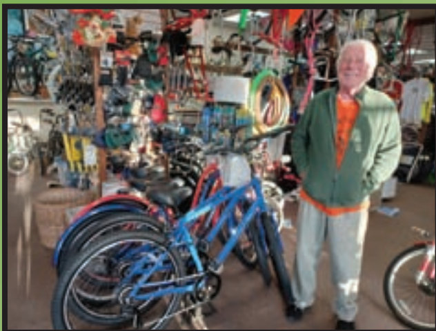
FINAL DAYS OF 2022 SALE AT ALGIE'S PLACE BIKES • SEE PAGE 2