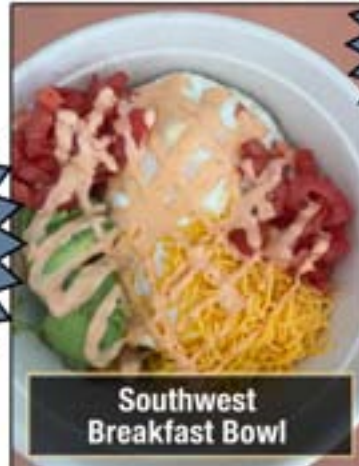
Southwest Breakfast Bowl