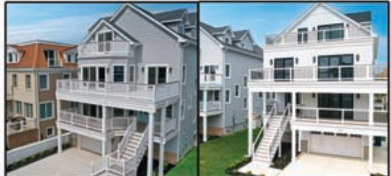
107 & 109 South Cambridge • Ventnor New Construction • Beach Block

kw ATLANTIC SHORE BRIGANTINE KELLERWILLIAMS. REALTY