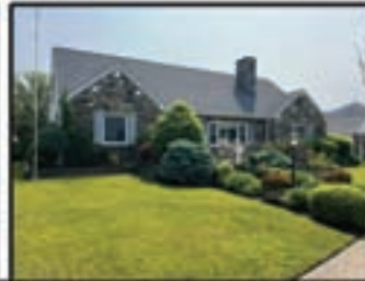
1904 W. Brigantine Ave • Brigantine Double Lot - Beach Block