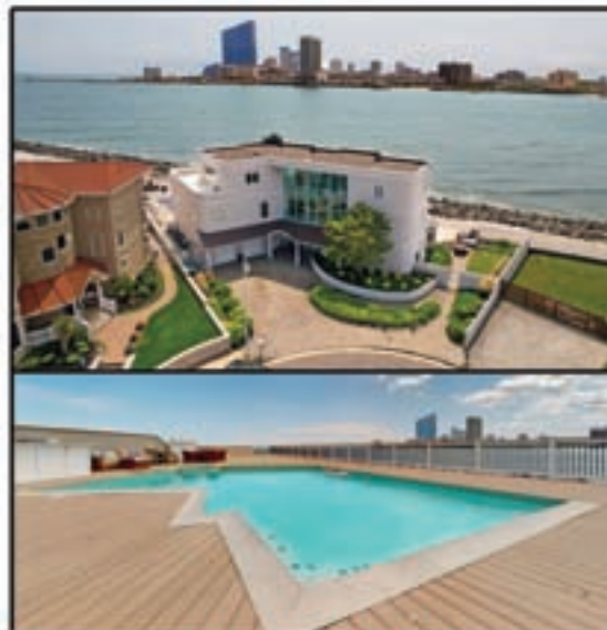
~ SUMMER RENTAL ~ 4 Sunset Ct • Brigantine