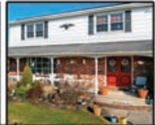
701 E.Shore Drive • Brigantine 2.5 Lots - Pool/Solar