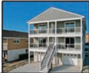
104 31st Street South • Brigantine 4 Units - New Construction

Mike Riordan (609) 339-6004 MrBrigantine.com