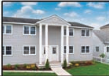
326 37th Street South • Brigantine Beach Block