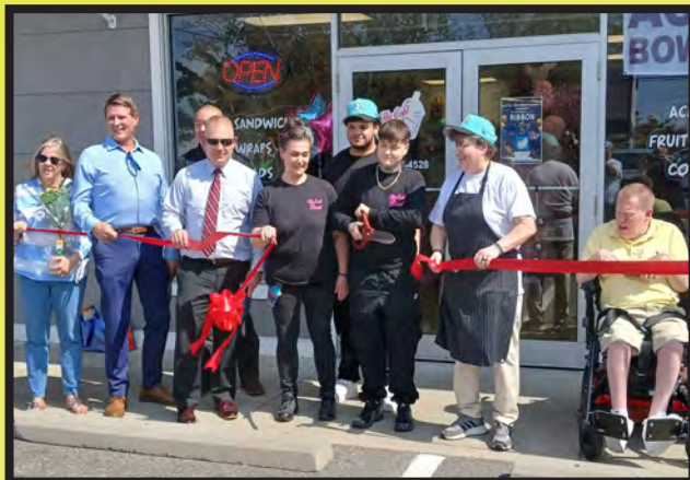
CHECK OUT THE NEW MENU FOR THE COLD BOWL IN RIO GRANDE • SEE PAGE 9