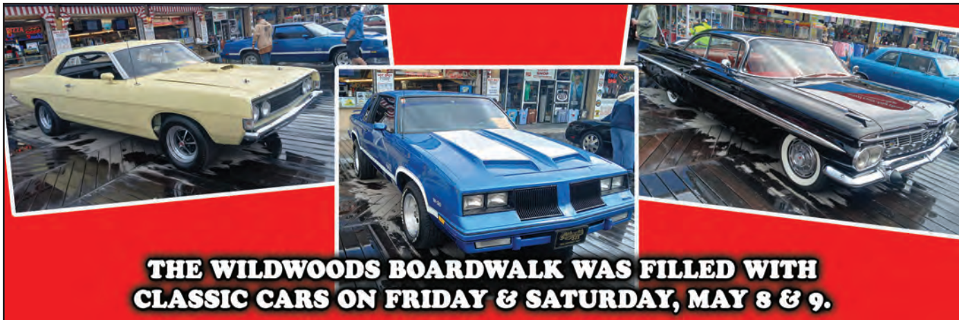
THE WILDWOODS BOARDWALK WAS FILLED WITH CLASSIC CARS ON FRIDAY & SATURDAY, MAY 8 & 9.