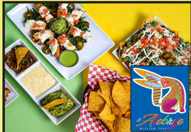
FANTASTIC MEXICAN FOOD AT EL ALEBRIFE - NOW OPEN DAILY FOR LUNCH & DINNER • SEE PAGE 10